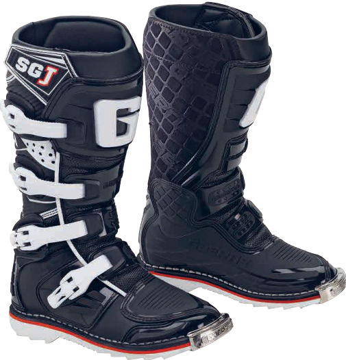
2166 001 | SG-J BLACK | EU 33 34 35 36 37 38 39 40 US 12 3 4 5 6