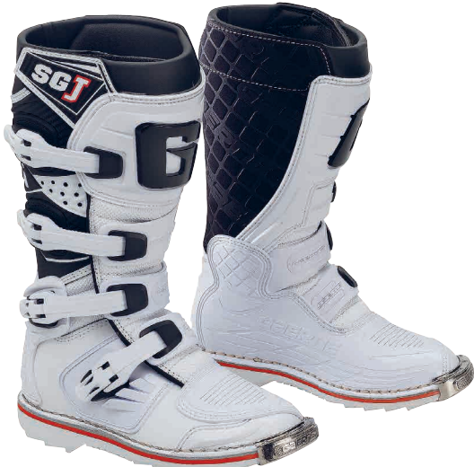
2166 004 | SG-J WHITE | EU 33 34 35 36 37 38 39 40 US 12 3 4 5 6