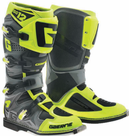
2174 O49 | SG-12 YELLOW | EU 41 42 43 44 45 46 47 48 US 7 8 9 10 11 12 13