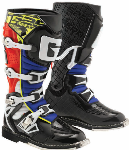
2180005 G. REACT GOODYEAR RED - YELLOW EU 41 42 43 44 45 46 47 48 US 7 8 9 10 11 12 13