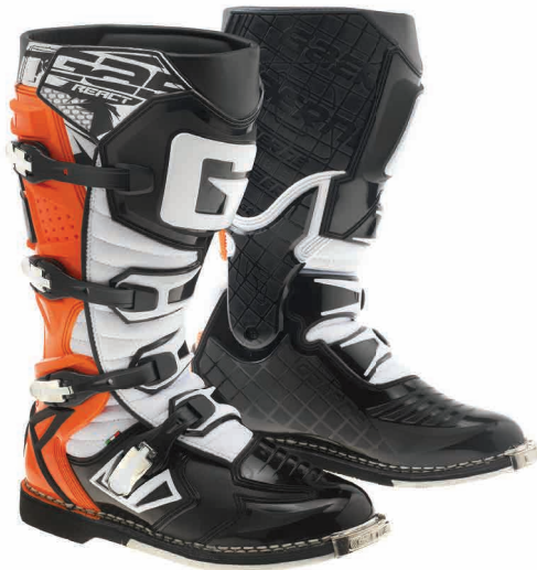
2180008 G. REACT GOODYEAR ORANGE EU 41 42 43 44 45 46 47 48 US 7 8 9 10 11 12 13