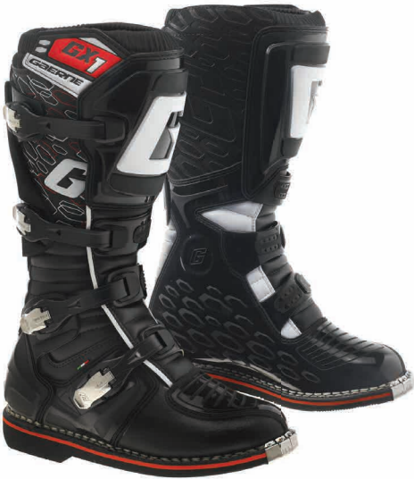
2184001 GXI GOODYEAR BLACK EU 38 39 40 41 42 43 44 45 46 47 48 49 US 5 6 7 8 9 10 11 12 13 14