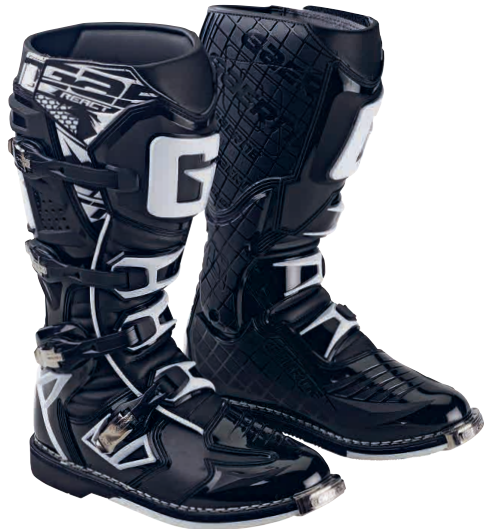
2180001 G. REACT GOODYEAR BLACK EU 41 42 43 44 45 46 47 48 49 US 7 8 9 10 11 12 13 14