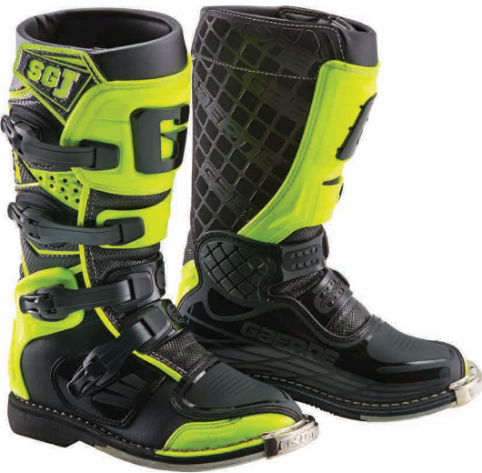
2166 019 | SG-J BLACK YELLOW FLUO | EU 33 34 35 36 37 38 39 40 US 12 3 4 5 6