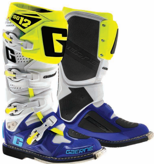
2174 O50 | SG-12 WHITE / BLUE YELLOW FLUO | EU 41 42 43 44 45 46 47 48 USA 7 8 9 10 11 12 13