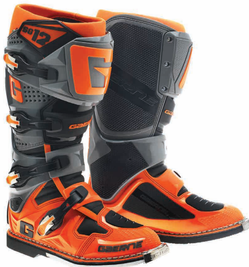
2174 O38 | SG-12 ORANGE | EU 41 42 43 44 45 46 47 48 US 7 8 9 10 11 12 13