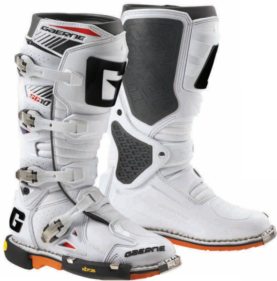
2191 004 SG IO SUPER MOTARD WHITE U 39 40 41 42 43 44 45 46 47 48 49 US 6 7 8 9 10 11 12 13 14