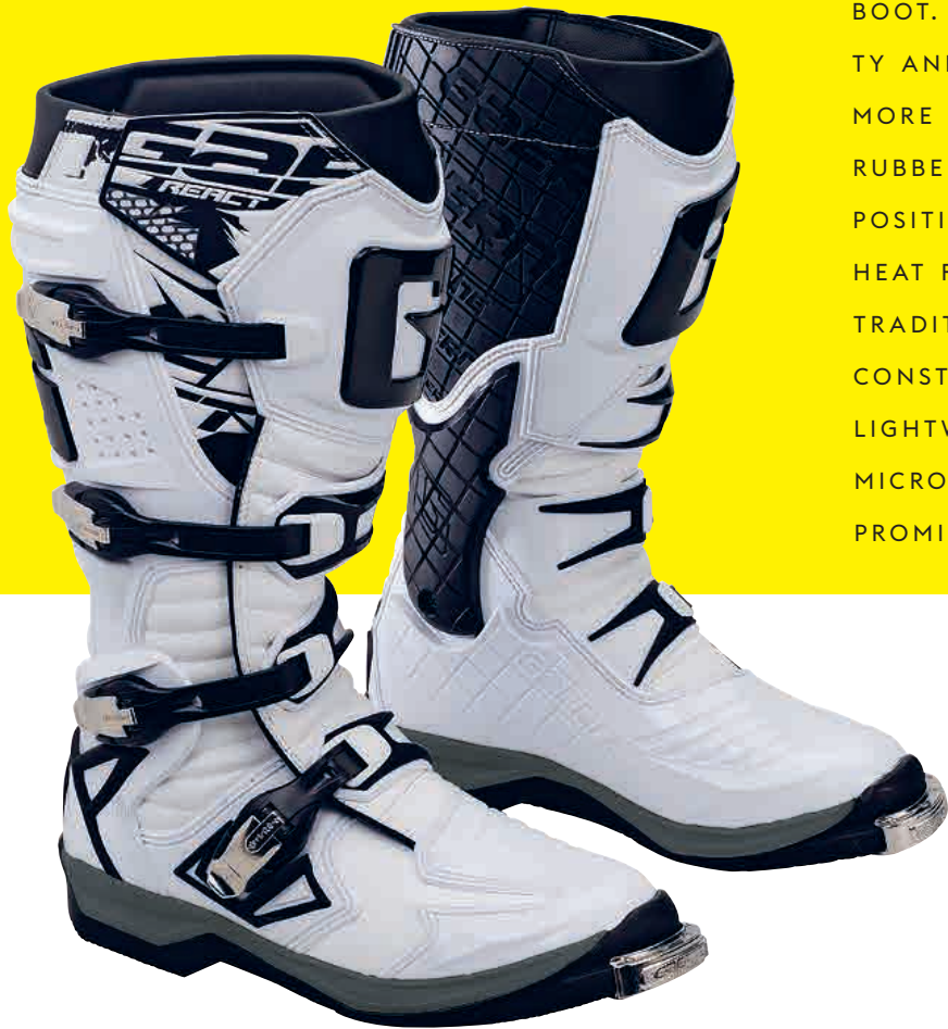
2188004 G. REACT WHITE EU 41 42 43 44 45 46 47 48 49 US 7 8 9 10 11 12 13 14

THIS BOOT INCORPORATES AGGRESSIVE STYLING AND ADVANCED TECHNOLOGY THAT IS SURE TO IMPRESS FROM THE MOMENT YOU SLIP YOUR FOOT INTO THE BOOT. MADE IN ITALY FOR UNPARALLELED QUALITY AND PERFORMANCE. ALL NEW UNI-PIVOT OFFERS MORE SUPPORT AND ADDITIONAL COMFORT. NEW RUBBER "GRIP GUARD" HELPS THE RIDER HOLD HIS POSITION ON THE BIKE AS WELL AS DISPLACE THE HEAT FROM THE PIPE. WE OFFER TWO CHOICES: THE TRADITIONAL STITCH ON SOLE (GOODYEAR WELT CONSTRUCTION) OR A NEW MOLDED WELT SOLE FOR LIGHTWEIGHT FEEL. NEW SLIMER FIT ALONG WITH NEW MICROFIBER INTERIOR AND ERGONOMIC LINER ALL PROMISE TO DELIVER COMFORT AND PROTECTION.