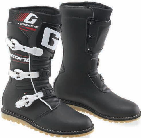
2532 001 BALANCE CLASSIC BLACK EU 38 39 40 41 42 43 44 45 46 47 48 49 US 5 6 7 8 9 10 11 12 13 14