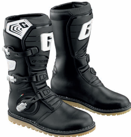
2524 001 BALANCE PRO TECH BLACK EU 38 39 40 41 42 43 44 45 46 47 48 49 US 5 6 7 8 9 10 11 12 13 14