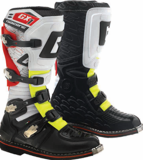
2184009 GXI GOODYEAR YELLOW EU 38 39 40 41 42 43 44 45 46 47 48 US 5 6 7 8 9 10 11 12 13