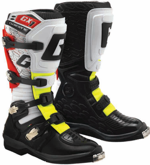
2185009 GXI EVO YELLOW EU 41 42 43 44 45 46 47 48 US 7 8 9 10 11 12 13