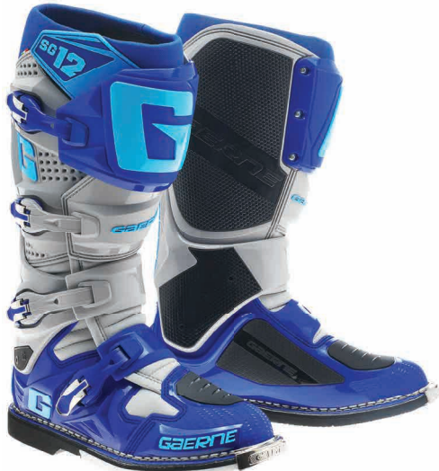
2174 O33 | SG-12 BLUE | EU 41 42 43 44 45 46 47 48 US 7 8 9 10 11 12 13