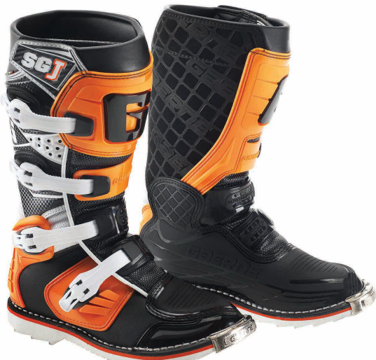
2166 018 | SG-J ORANGE | EU 33 34 35 36 37 38 39 40 US 12 3 4 5 6