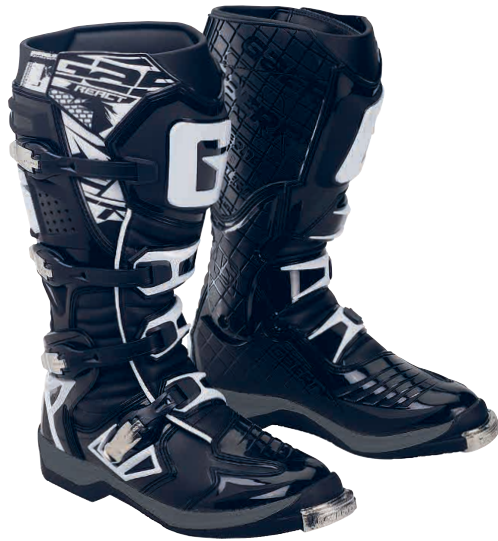
2188001 G. REACT BLACK EU 41 42 43 44 45 46 47 48 49 US 7 8 9 10 11 12 13 14