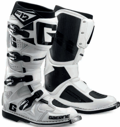
2174 O04 | SG-12 WHITE | EU 41 42 43 44 45 46 47 48 49 US 7 8 9 10 11 12 13 14