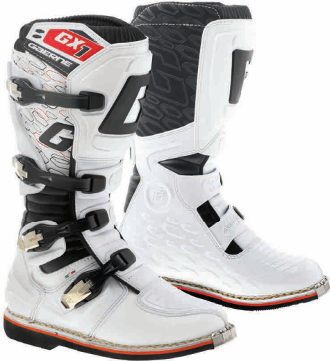
2184004 GXI GOODYEAR WHITE EU 38 39 40 41 42 43 44 45 46 47 48 49 US 5 6 7 8 9 10 11 12 13 14