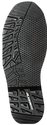
2189001 G. REACT ENDURO EU 41 42 43 44 45 46 47 48 49 US 7 8 9 10 11 12 13 14