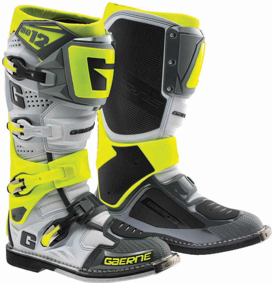
2174 O51 | SG-12 WHITE / GREY YELLOW FLUO | EU 41 42 43 44 45 46 47 48 USA 7 8 9 10 11 12 13