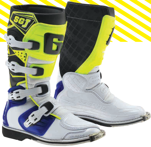
2166 050 | SG-J WHITE BLUE YELLOW FLUO | EU 33 34 35 36 37 38 39 40 US 12 3 4 5 6