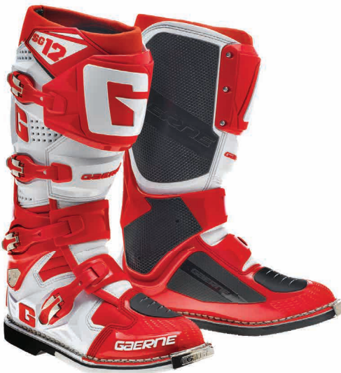
2174 O35 | SG-12 WHITE RED | EU 41 42 43 44 45 46 47 48 US 7 8 9 10 11 12 13