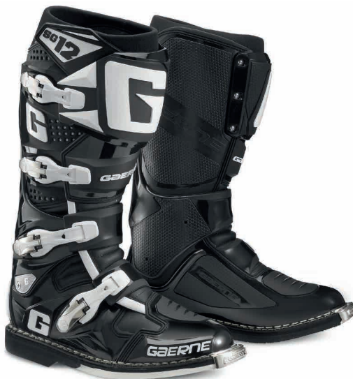
2174 O01 | SG-12 BLACK | EU 41 42 43 44 45 46 47 48 49 US 7 8 9 10 11 12 13 14