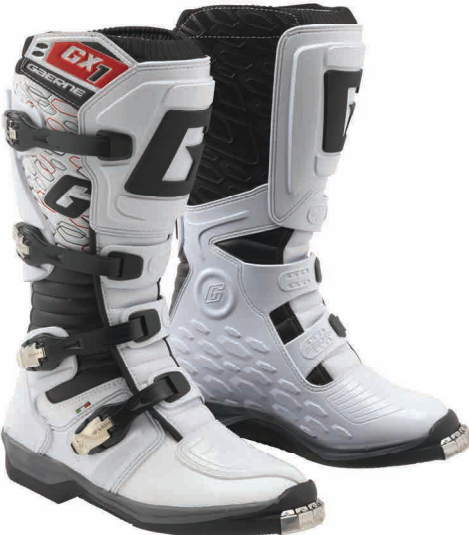
2185004 GXI EVO WHITE EU 41 42 43 44 45 46 47 48 49 US 7 8 9 10 11 12 13 14