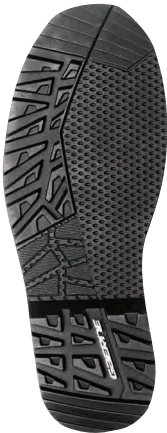
2186001 GXI ENDURO BLACK EU 38 39 40 41 42 43 44 45 46 47 48 49 US 5 6 7 8 9 10 11 12 13 14