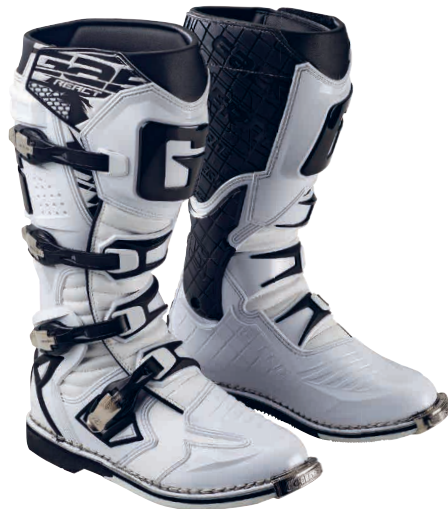
2180004 G. REACT GOODYEAR WHITE EU 41 42 43 44 45 46 47 48 49 US 7 8 9 10 11 12 13 14

THIS BOOT INCORPORATES AGGRESSIVE STYLING AND ADVANCED TECHNOLOGY THAT IS SURE TO IMPRESS FROM THE MOMENT YOU SLIP YOUR FOOT INTO THE BOOT. MADE IN ITALY FOR UNPARALLELED QUALITY AND PERFORMANCE. ALL NEW UNI-PIVOT OFFERS MORE SUPPORT AND ADDITIONAL COMFORT. NEW RUBBER "GRIP GUARD" HELPS THE RIDER HOLD HIS POSITION ON THE BIKE AS WELL AS DISPLACE THE HEAT FROM THE PIPE. WE OFFER TWO CHOICES: THE TRADITIONAL STITCH ON SOLE (GOODYEAR WELT CONSTRUCTION) OR A NEW MOLDED WELT SOLE FOR LIGHTWEIGHT FEEL. NEW SLIMER FIT ALONG WITH NEW MICROFIBER INTERIOR AND ERGONOMIC LINER ALL PROMISE TO DELIVER COMFORT AND PROTECTION.