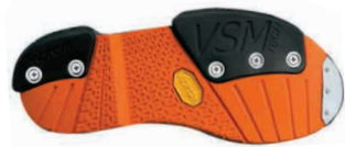
4673 001 VSM S.MOTARD ORANGE SOLE

THE NEW VIBRAM SOLE IS MOULDED FROM A SPECIAL COMPOUND WHICH IS HIGHLY RESISTANT TO WEAR AND HAS A SPECIAL FEATURE OF REPLACEABLE SLIDERS WHICH PROTECTS AND LIMITS DAMAGE TO THE SOLE.