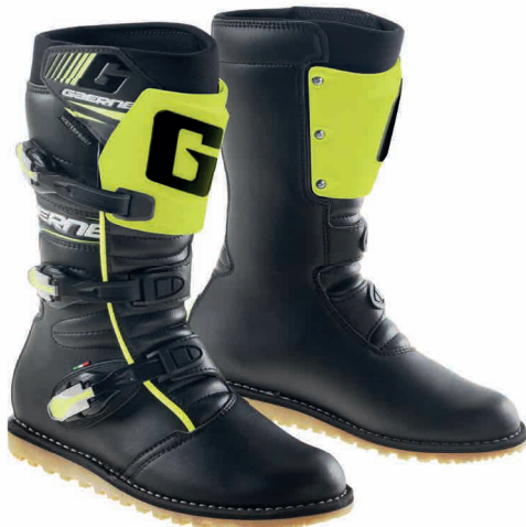
2532 019 BALANCE CLASSIC YELLOW FLUO EU 38 39 40 41 42 43 44 45 46 47 48 49 US 5 6 7 8 9 10 11 12 13 14

THIS TRIAL BOOT IS MADE WITH MICROFIBER TO GRANT LIGHTNESS AND COMFORT. IT IS ALSO WATERPROOF THANKS TO GAERNE DRYTECH MEMBRANE. A GUM RUBBER SOLE COMPLETES THE TASK FOR A GREAT FEEL AND CONTROL OF THE BIKE.