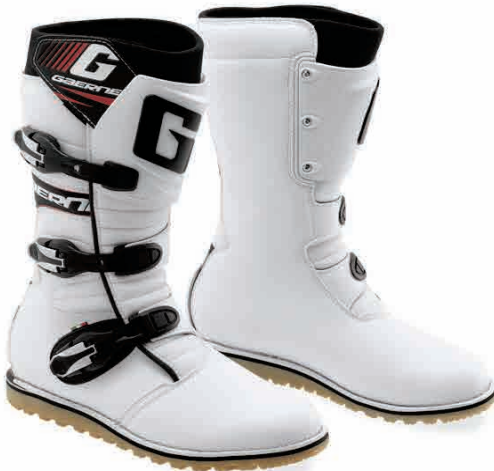
2532 004 BALANCE CLASSIC WHITE EU 38 39 40 41 42 43 44 45 46 47 48 49 US 5 6 7 8 9 10 11 12 13 14