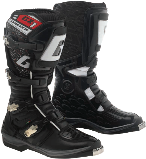
2185001 GXI EVO BLACK EU 41 42 43 44 45 46 47 48 49 US 7 8 9 10 11 12 13 14