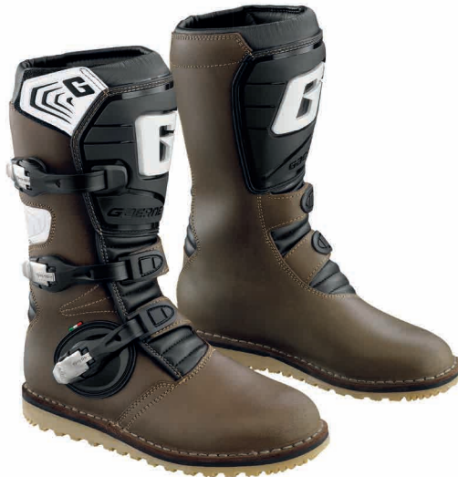
2524 013 BALANCE PRO TECH BROWN EU 38 39 40 41 42 43 44 45 46 47 48 49 US 5 6 7 8 9 10 11 12 13 14